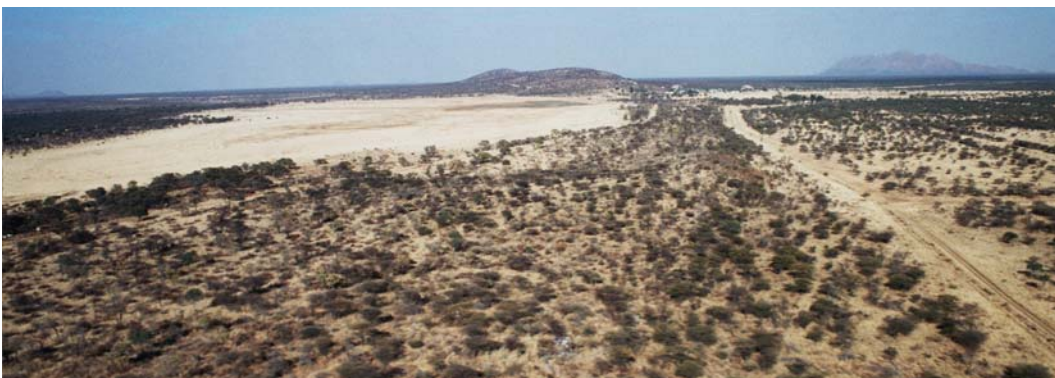
Photo 10: The pale area on the left appears to be a seasonal moist grassland on the farm Omatjenne, just south of the Otjiwarongo – Outjo tar road.