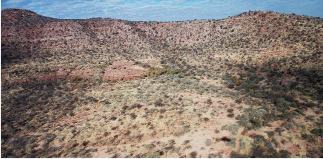
Photo 8: The route passes close to these red rocky outcrops of the Omborokoberg.